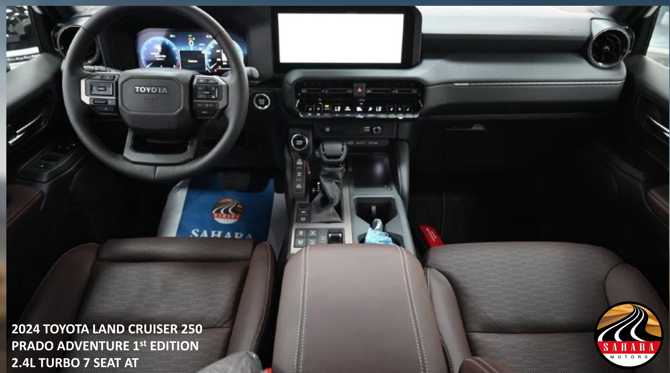
2024 TOYOTA LAND CRUISER 250 PRADO ADVENTURE 1 st EDITION 2.4L TURBO 7 SEAT AT