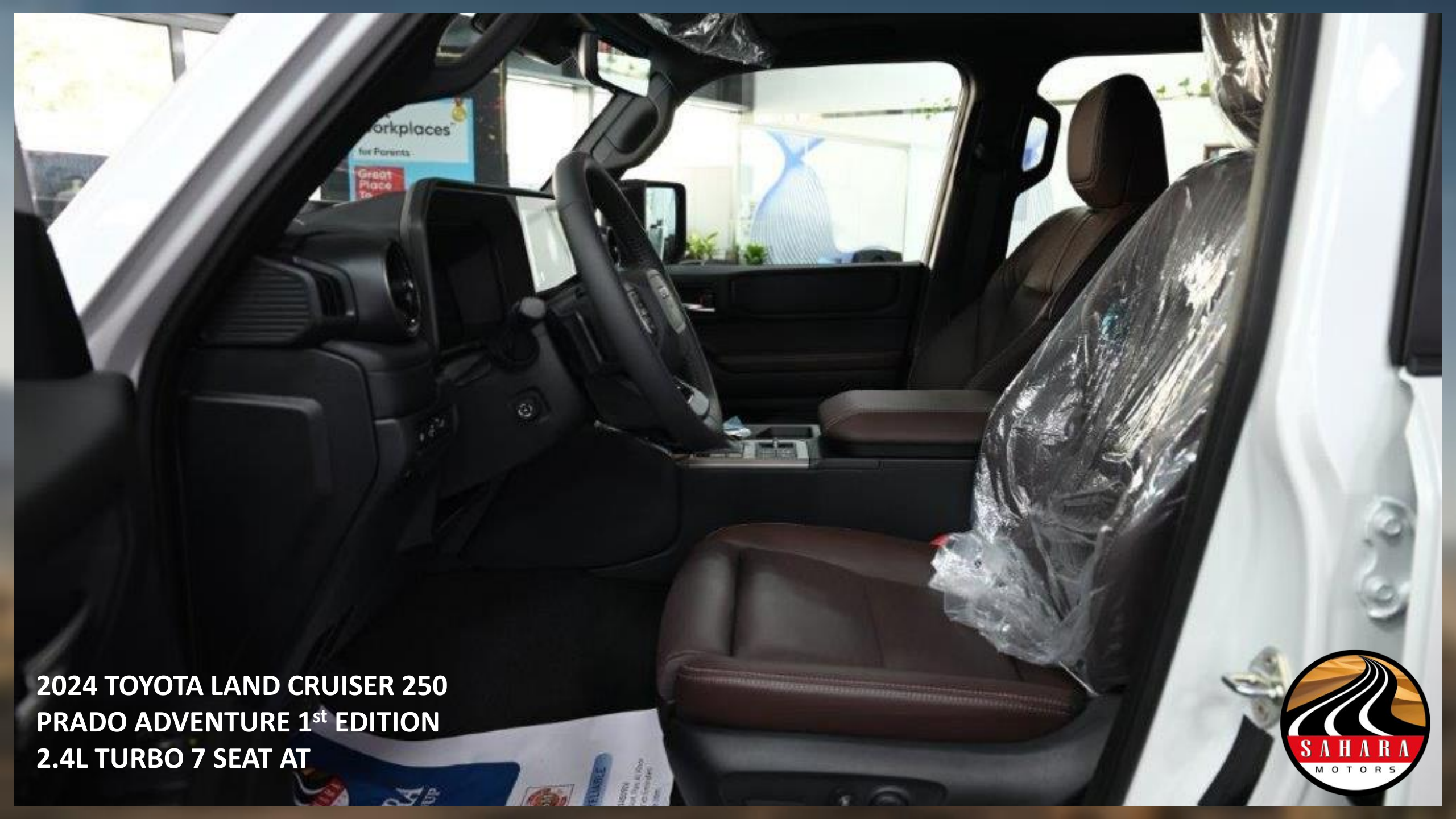
2024 TOYOTA LAND CRUISER 250 PRADO ADVENTURE 1 st EDITION 2.4L TURBO 7 SEAT AT