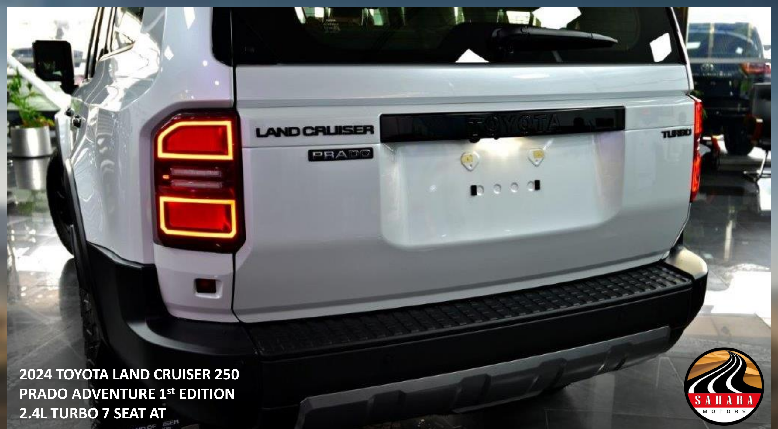
2024 TOYOTA LAND CRUISER 250 PRADO ADVENTURE 1 st EDITION 2.4L TURBO 7 SEAT AT