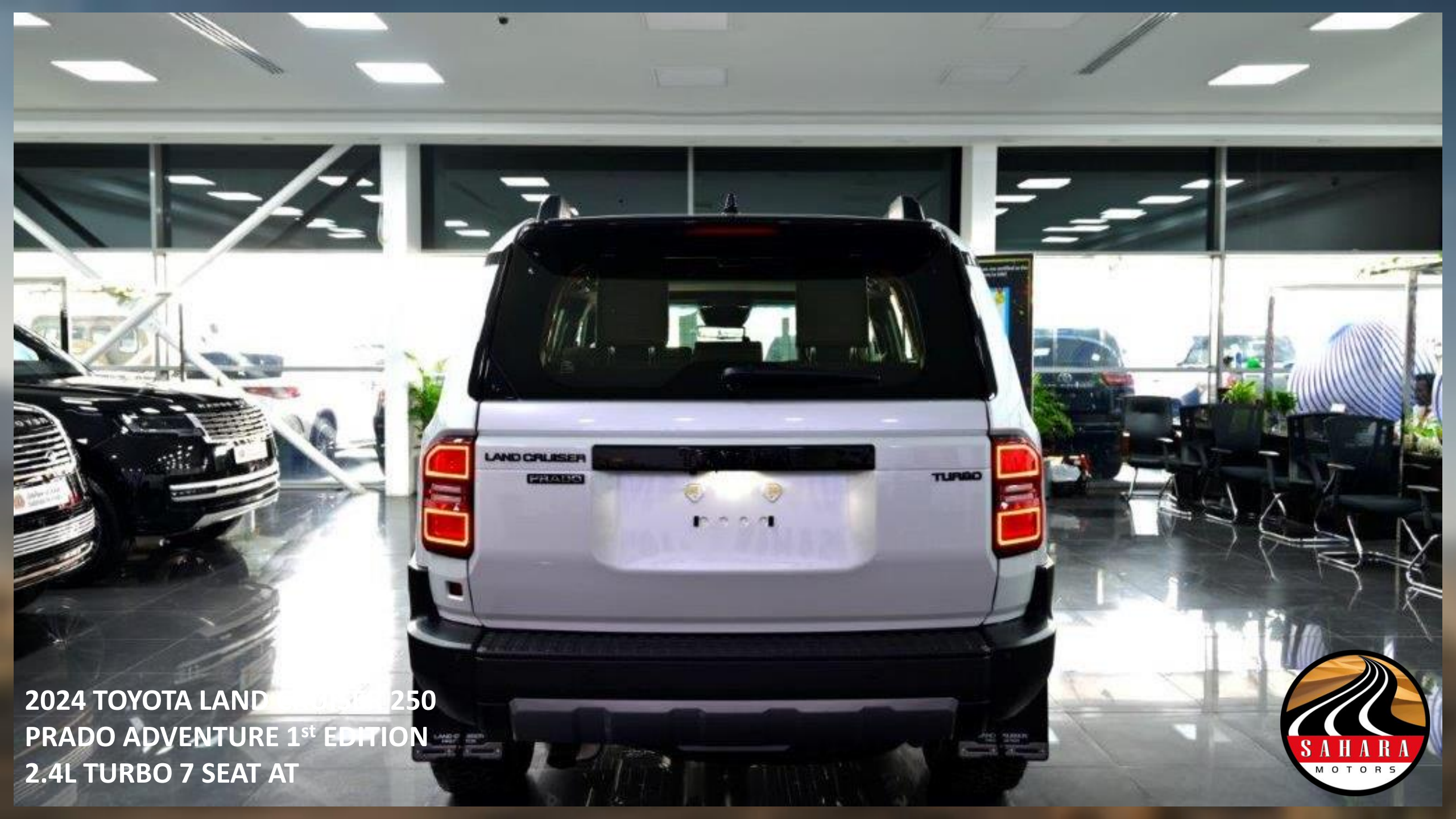
2024 TOYOTA LAND CRUISER 250 PRADO ADVENTURE 1 st EDITION 2.4L TURBO 7 SEAT AT