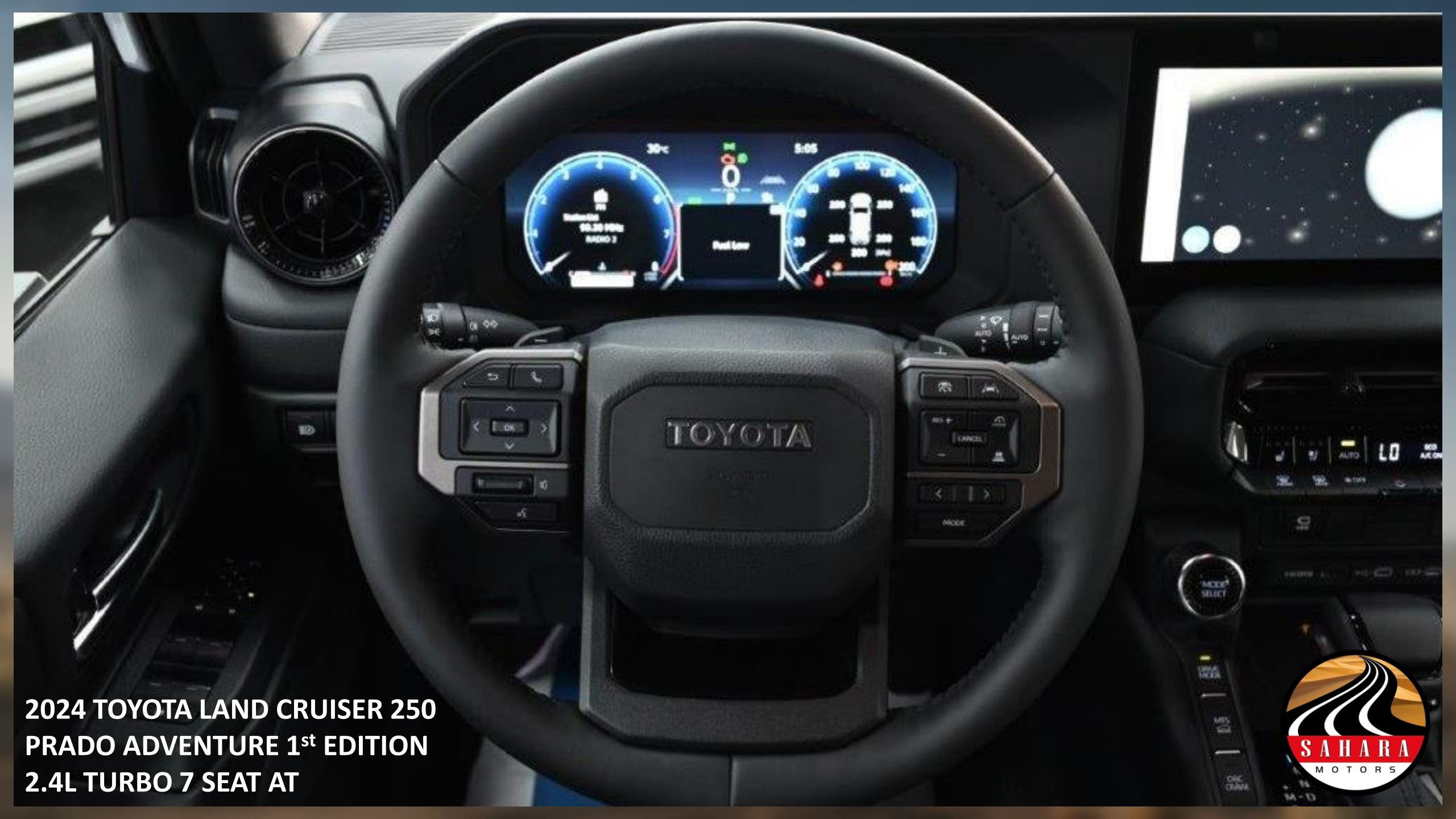
2024 TOYOTA LAND CRUISER 250 PRADO ADVENTURE 1 st EDITION 2.4L TURBO 7 SEAT AT