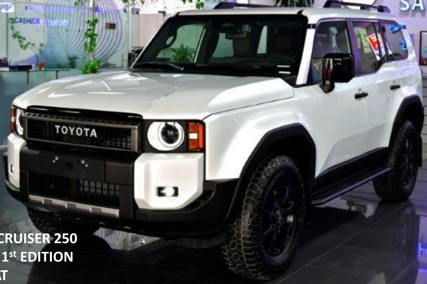
2024 TOYOTA LAND CRUISER 250 PRADO ADVENTURE 1 st EDITION 2.4L TURBO 7 SEAT AT