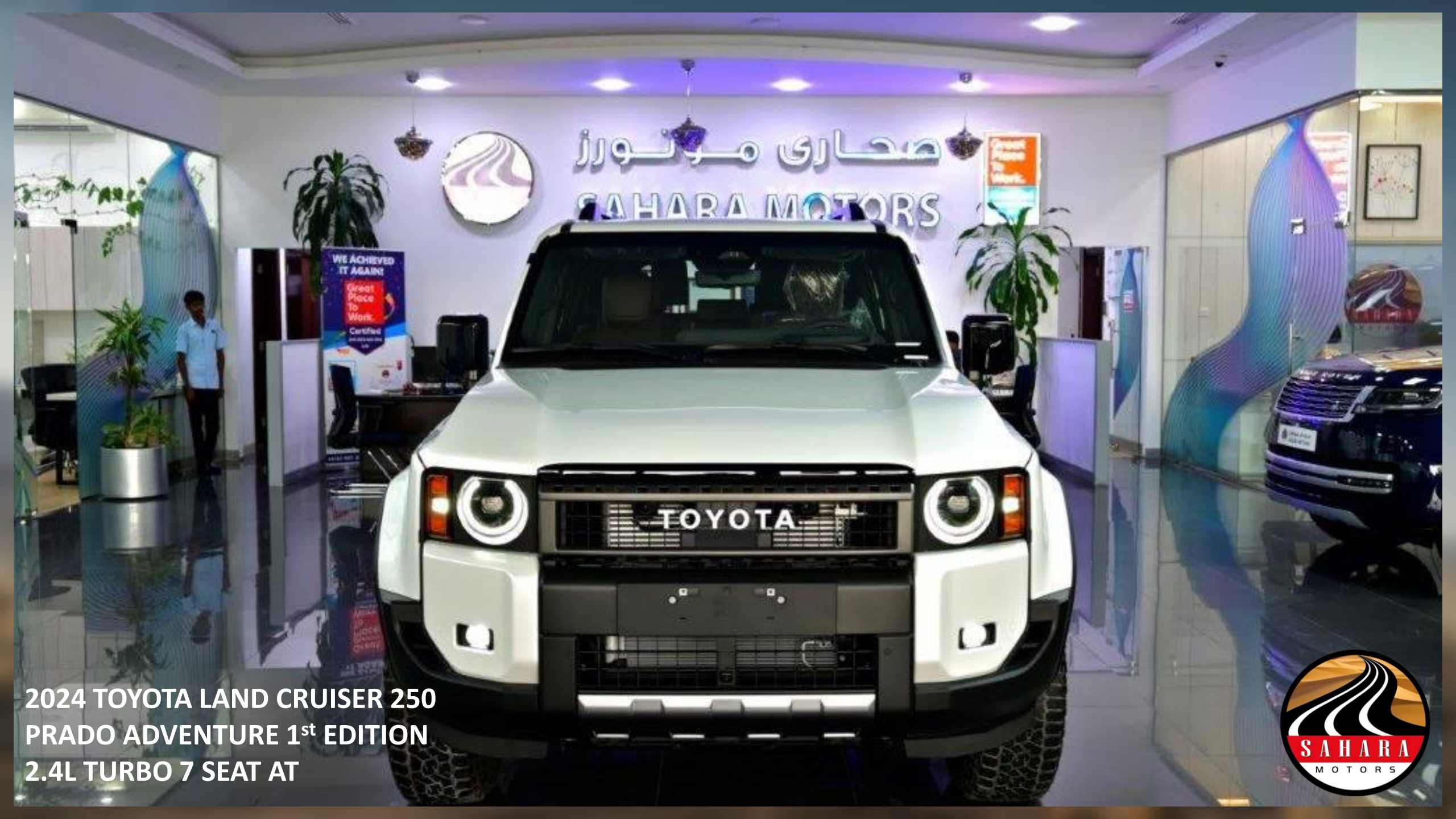
2024 TOYOTA LAND CRUISER 250 PRADO ADVENTURE 1 st EDITION 2.4L TURBO 7 SEAT AT