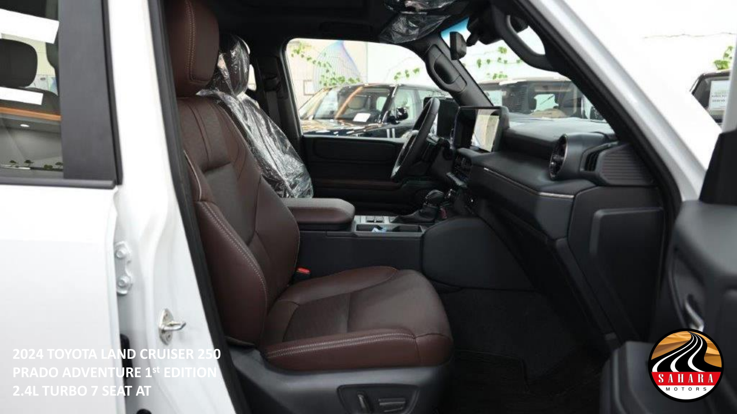
2024 TOYOTA LAND CRUISER 250 PRADO ADVENTURE 1 st EDITION 2.4L TURBO 7 SEAT AT